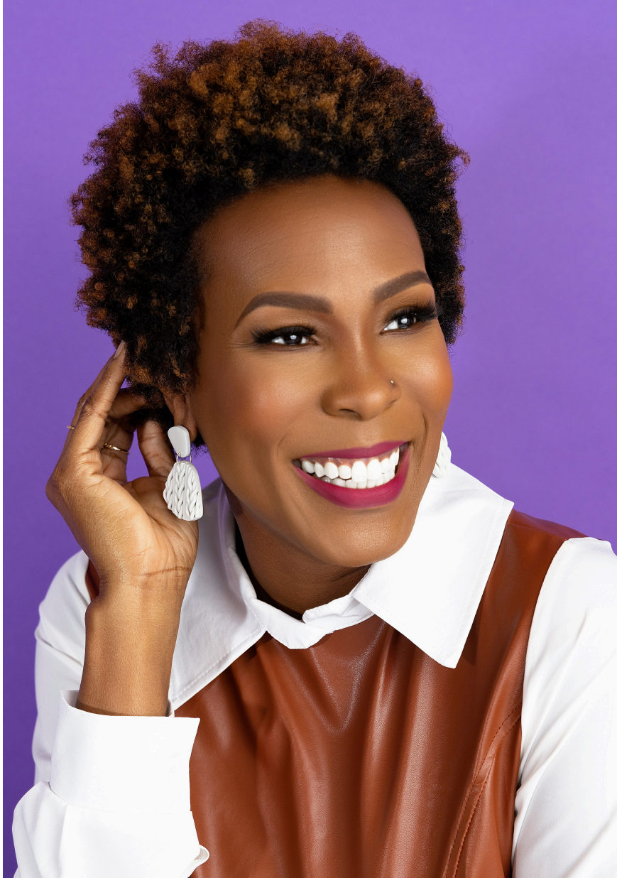
WOMEN IN BUSINESS EXPO